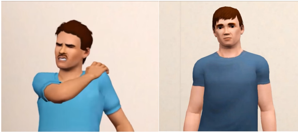
Figure 1. Example of virtual humans

Right image displays a Hispanic patient displaying severe pain. The left image displays a non-Hispanic White patient displaying mild pain.